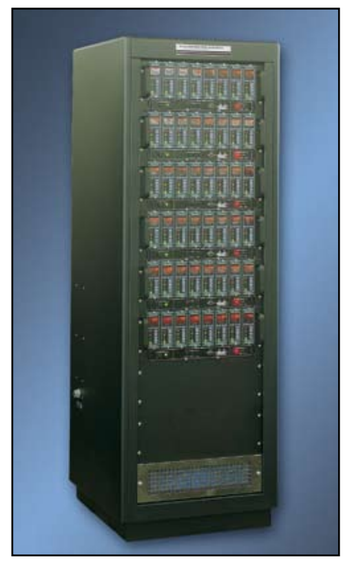
Control Module System Enclosure (figure 1)