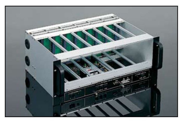
Control Module (figure 2)