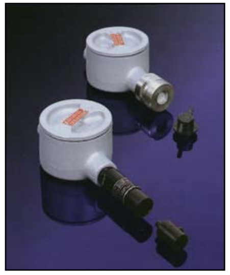
Field Mounted Detectors

A wide variety of sensor configurations are available to meet specific application requirements including stainless steel sensor housings, lead or silicone resistance, and