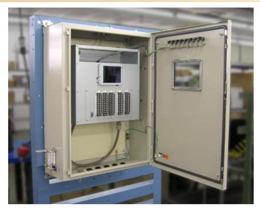
Model 7500B serves as the explosion proof configuration of the series. The NEMA-4 enclosure can be X or Z-purged

to satisfy hazardous area installation requirements.