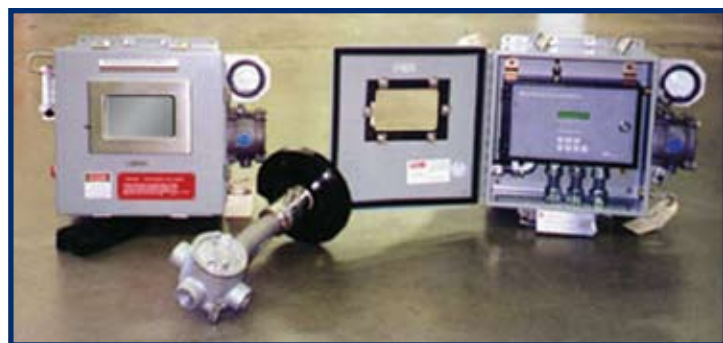
9060 with the Z-Purge option